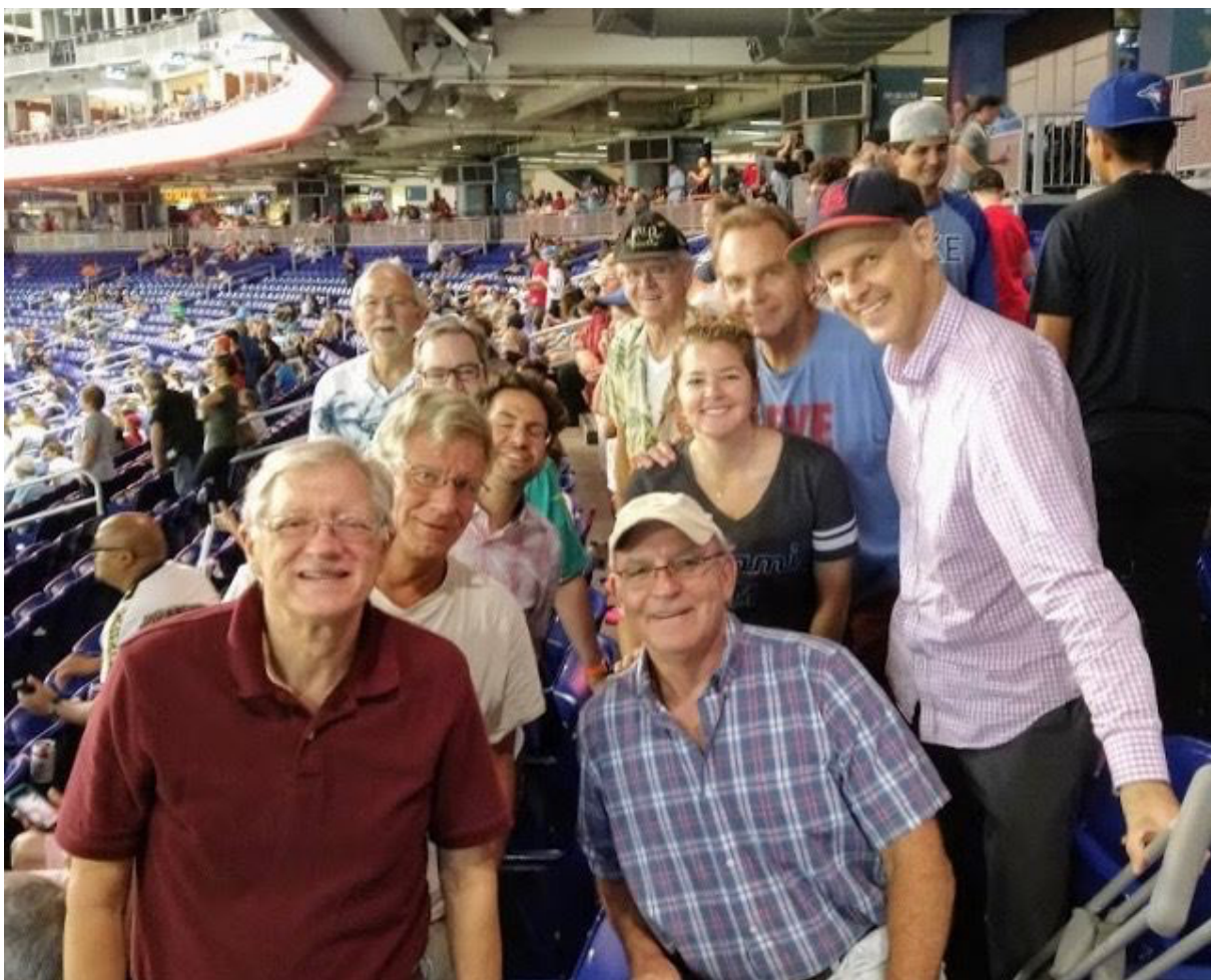
Photo Above: Our RPCVSVF group at the Marlins vs. Diamondbacks game on July 27th