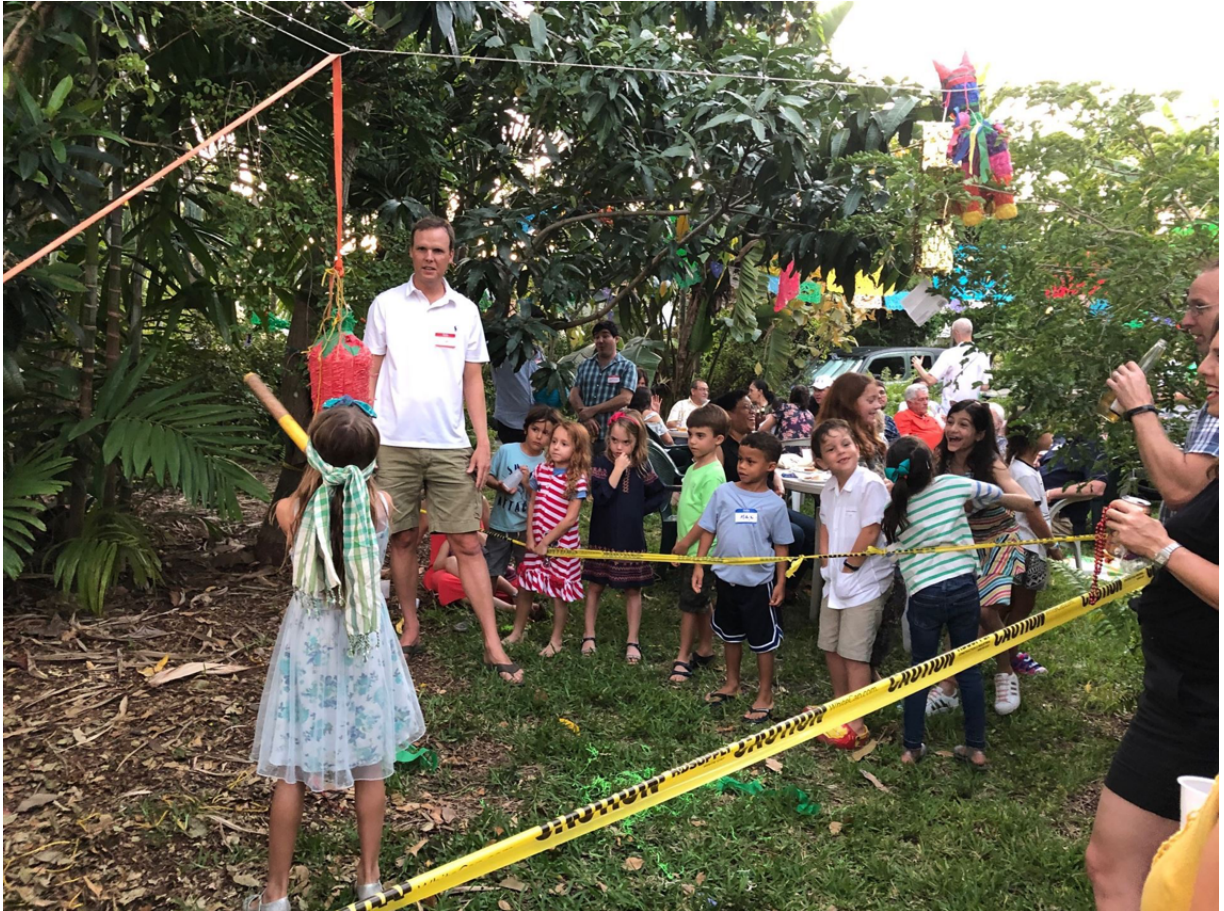
Above: Piñata time!