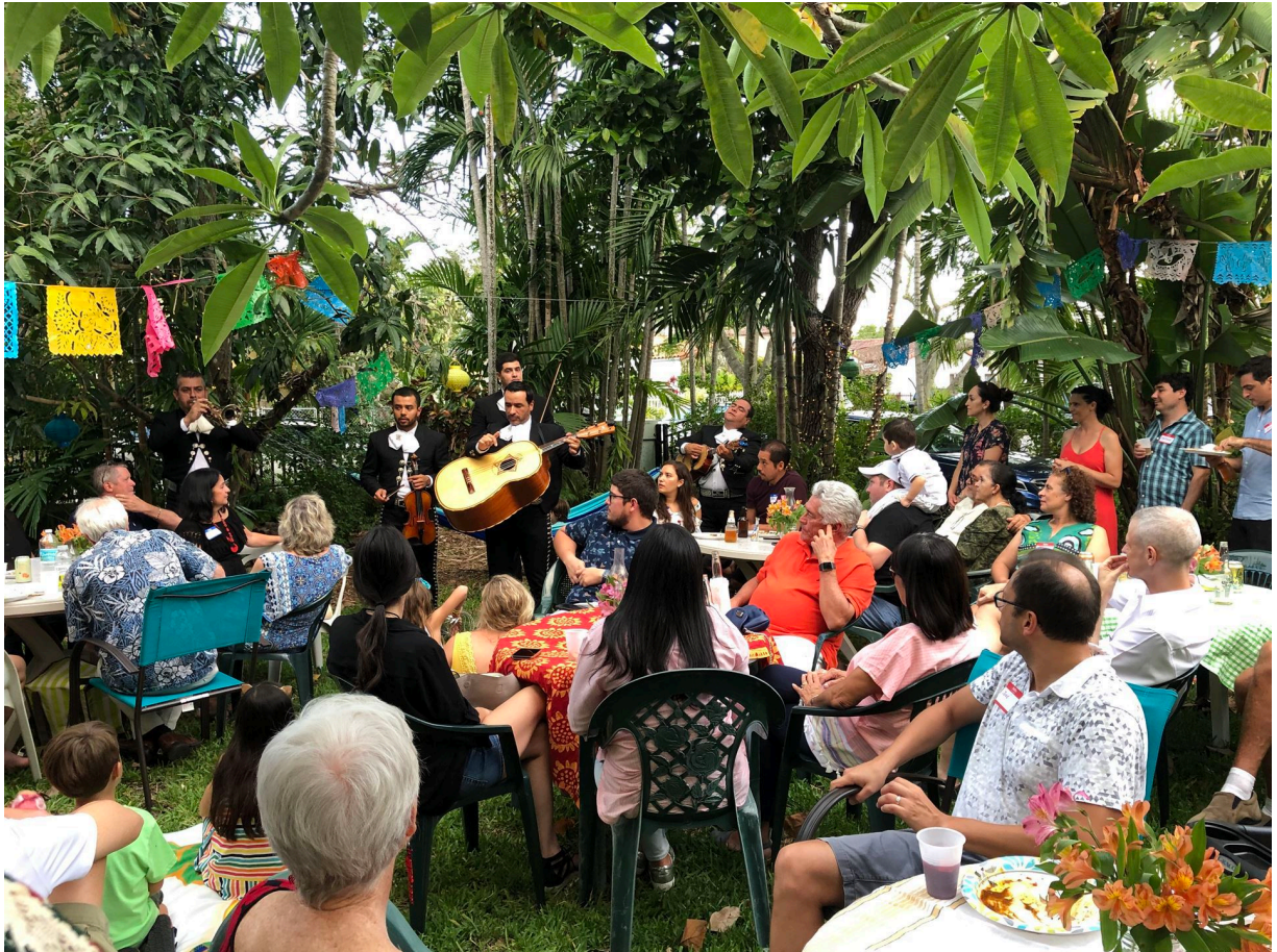
Above: Mariachis under the mango tree